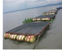
Floating cage for tilapia farming inside Lake Victoria

Cage Systems for Fish Culturing is a method where young fish are grown in submerged cages in large water bodies. The cages protect the fish, provide nourishment, and monitor their health. Once mature, the fish are harvested. This technique allows for natural, secure, and regulated fish farming, akin to a floating aquaculture facility.