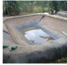
Excavated pond with liner

Pond liners, made of materials like PVC or polyethylene, act as synthetic geomembranes, preserving water, enhancing biosecurity, and simplifying pond maintenance. They are adaptable to various pond sizes and shapes, with plastic liners being robust but slightly harder to install in smaller ponds.