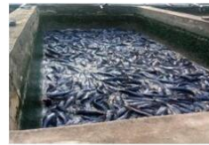
A concrete tank for raising catfish

A tank system for fish culturing is a land-based, intensive aquaculture enclosure. Made from materials like concrete or plastic, it requires a complete feed diet and can operate on various water and air supply systems. It's designed for high-density rearing of species like catfish and tilapia, with regular sorting needed. Success hinges on excellent water quality and year-round availability.