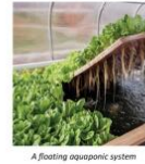
A floating aquaponic system

Aquaculture and Crops system for better yield