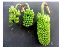
Progressive gain in bunch weight of cooking banana through selective breeding. A: grandparent, B: parent, and C: hybrid

The NARITA technology is a improved varieties for banana. NARITA hybrids are selected for their culinary quality, color, aroma, taste, texture, and mouthfeel. This technology enables the production of high-yielding bananas resistant to diseases and pests.