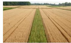
Later ripening and better grain filling of wheat due to water conservation in no-till system (middle)